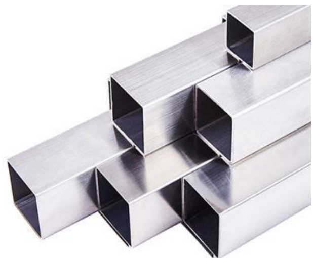
Jindal SS Square Pipe